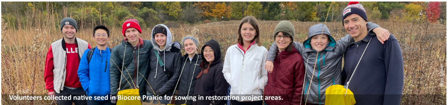
Volunteers collected native seed in Biocore Prairie for sowing in restoration project areas.

Preserve staff work diligently to maximize the positive impact of land stewardship, while remaining flexible and cautious not to do more harm than good, in the face of abrupt changes in weather patterns. Whether you are a bird, a plant, or a human land manager, living and working in nature is a predictably unpredictable endeavor.