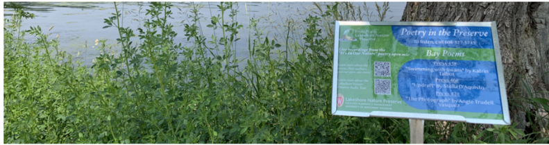
2023 "Poetry in the Preserve" Audio Trail