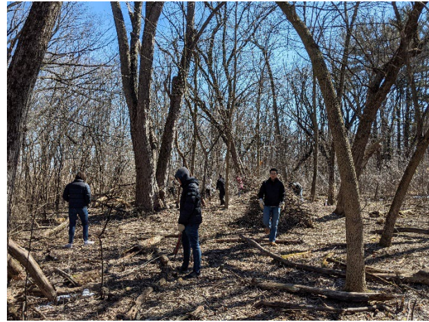
Frautschi Point Woods: before and after removing common buckthorn and bush honeysuckle EPIC and West High Public Health and Advocacy Club volunteers (March 19,2023)