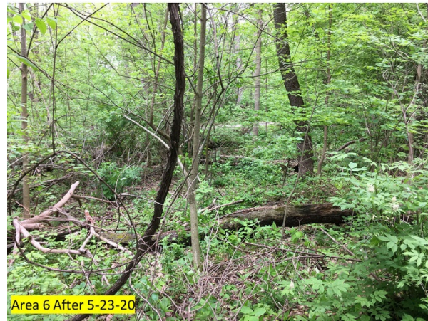
Area 6 After 5-23-20