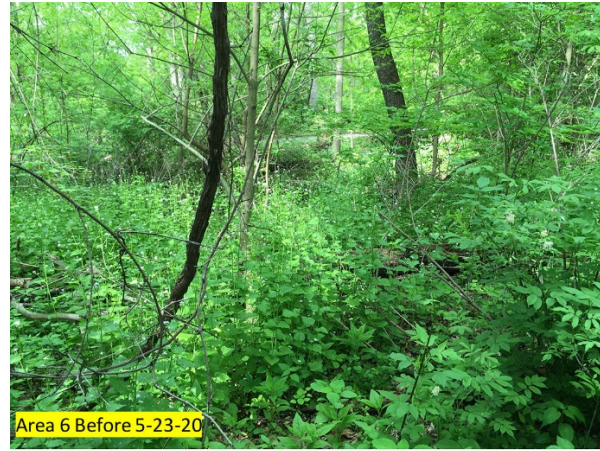
Area 6 Before 5-23-20