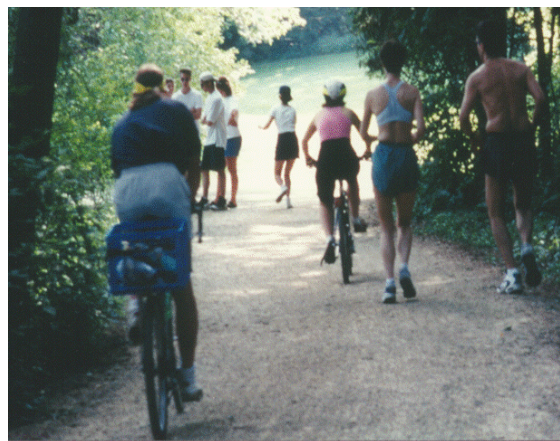
Woman jumping out of way (2007)