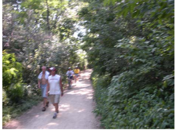
Pedestrians getting out of the way