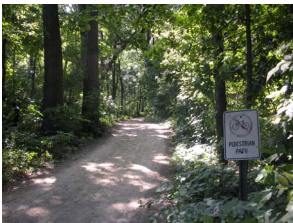
"No bike" sign on service road