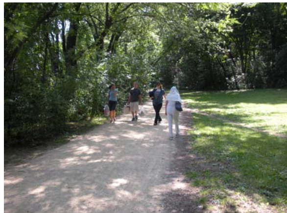
Pedestrians walking on widest path