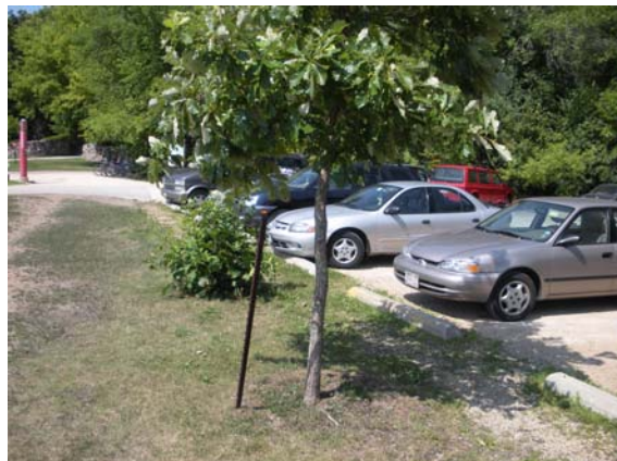
“Park bike” suggestion sign removed (over 100 yards from entrance)