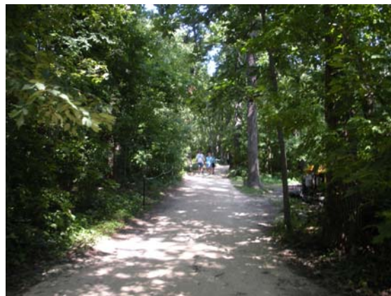
Pedestrians walking three abreast