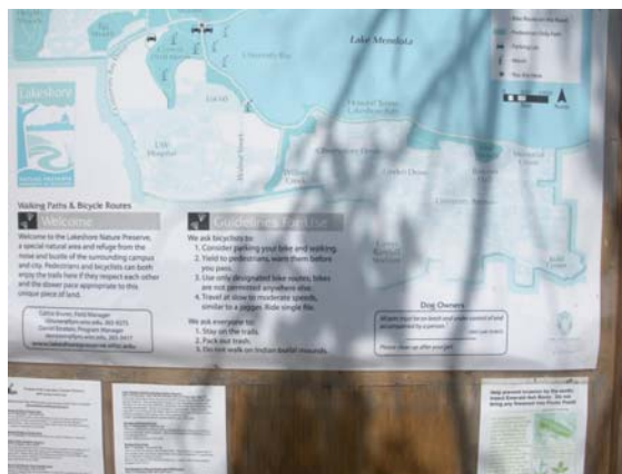
“Park bike” suggestion in sign