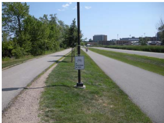
Willows divided bicycle-pedestrian path