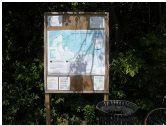
Sign over 30 feet from entrance