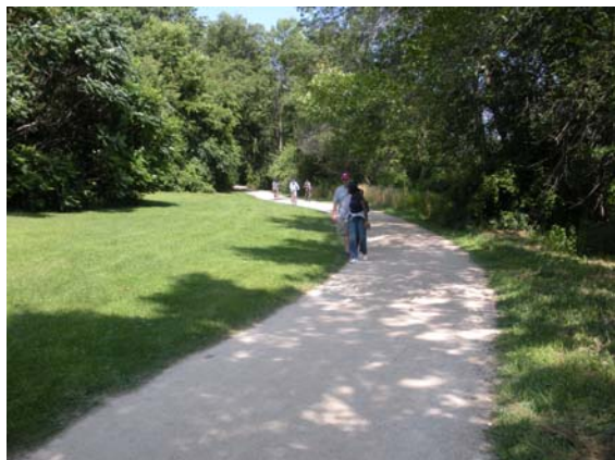
Pedestrians walking single file