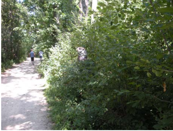
Sign suggesting bikes ride slowly